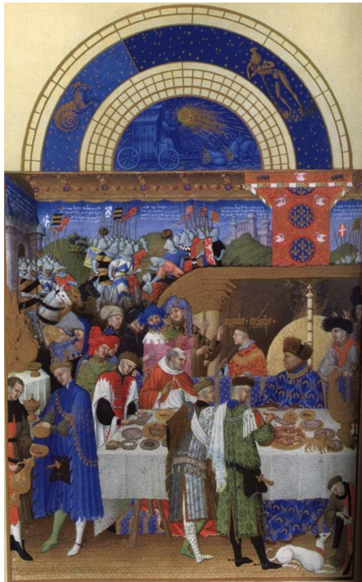
A late-Medieval image of New Year's Gift Giving--the January page of the Très Riches Heures du Duc du Berry,